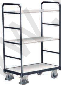
ESD table trolley Article no. esw500.258