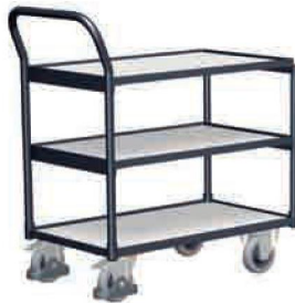
ESD table trolley Article no. esw500.657