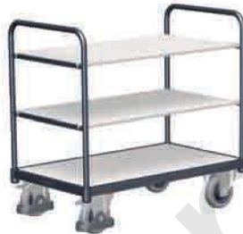
ESD table trolley Article no. esw500.257