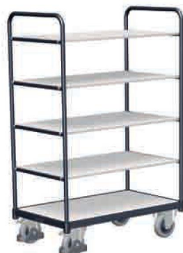
ESD table trolley Article no. esw500.259